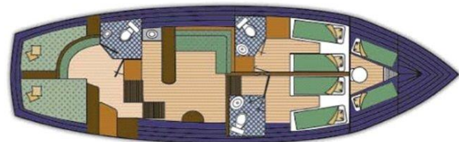
drawings of vessel areas